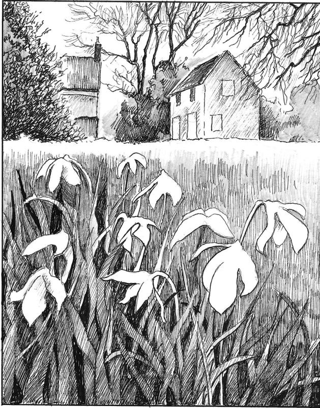
Snowdrops at Chapplegarth