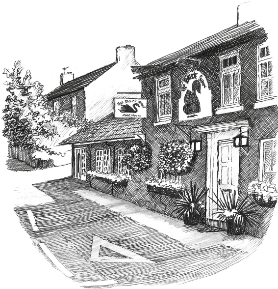
The Black Swan