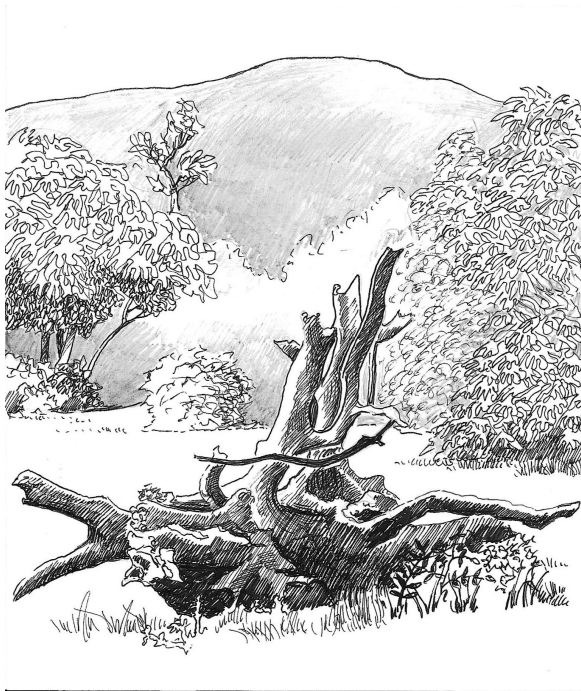
Little Broughton – Fallen Tree